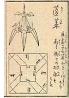
A page from Akisato Rito's Sembazuru Oriката