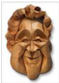
Eric Joisel mask

Traditional origami is characterized by open-access folding patterns and sequences passed down orally or anonymously from generation to generation. Modern origami often features models created by designers. Many of these models are considered copyrightable material or intellectual property. Modern origami often prioritizes a puzzle aspect to the folding, and the challenge of folding a single square of paper without using cuts or glue.